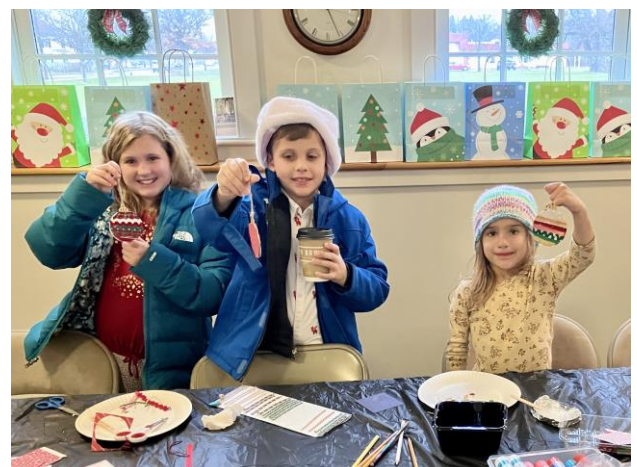
Families having fun at the Holiday Workshop in December