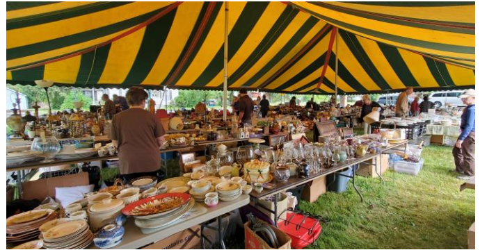
So many items, this was only one third of what we had at the sale.