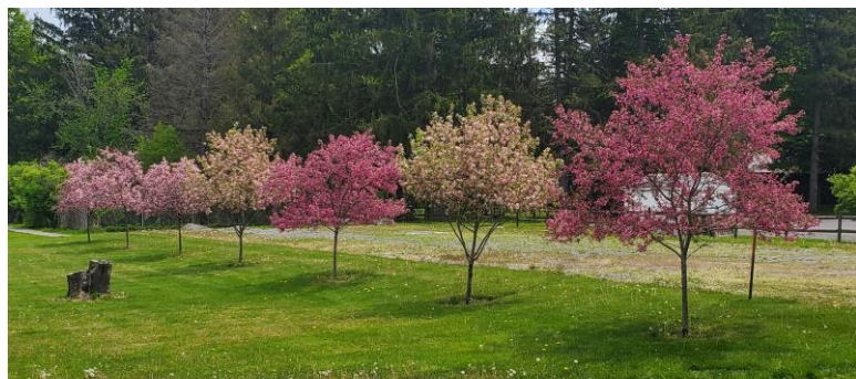
Our beautiful flowering trees in June