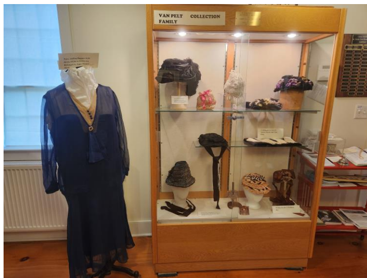
Clothing from the VanPelt Family Collection