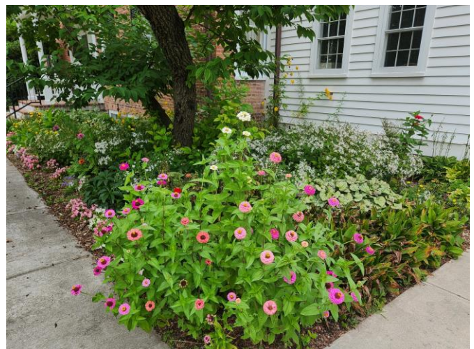
The garden in full bloom!