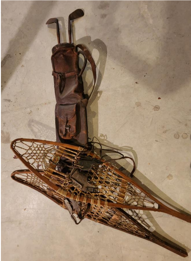
Found in the barn, an old golf bag, putters, and snowshoes

In each newsletter we will feature some interesting items from the Southworth Collection.