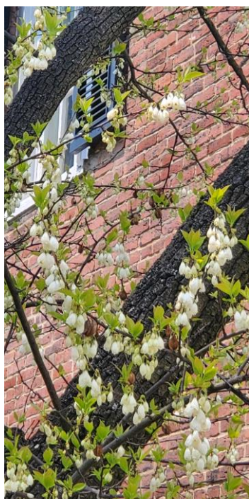
Silverbell Tree in Spring