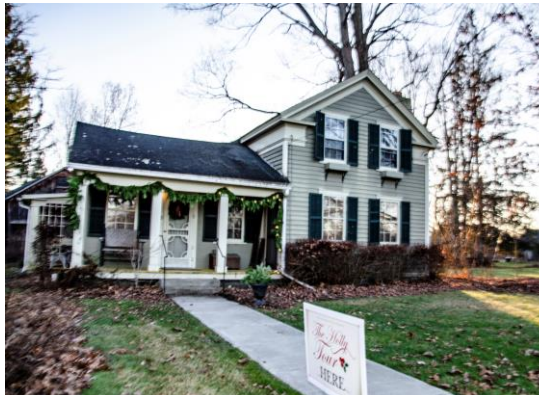
5 Mill Street, Freeville