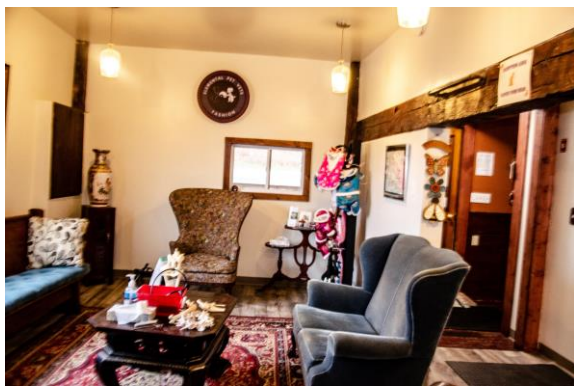
Elemental Pet Vets 1610 Dryden Road, Freeville