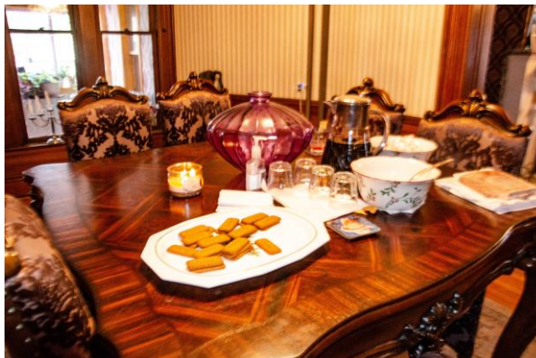
1609 Dryden Road, Freeville