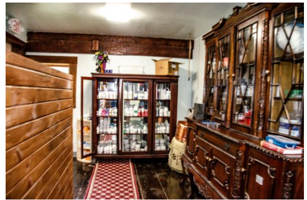
1610 Dryden Road