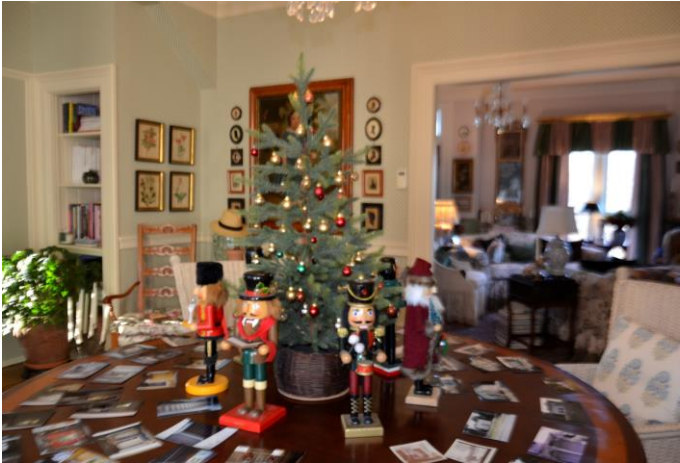
1477 Dryden Road, Freeville