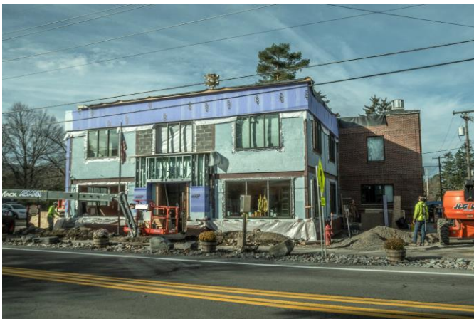
Renovation work at Dryden Village Hall

Doors will open at 6:30, and we will have refreshments. Free parking and handicap accessible.