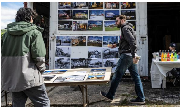
Old photos of Dryden