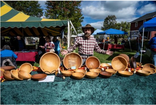
Mt. Pleasant Woodworks