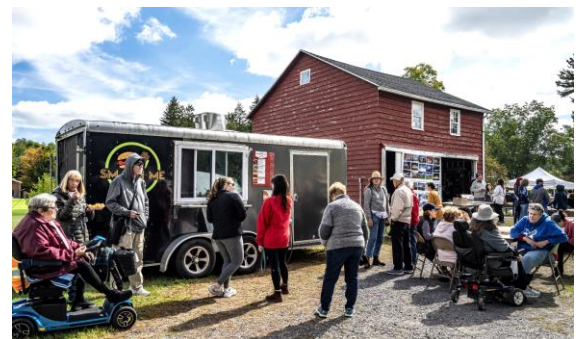
Busy Smash Me 607 Food Truck and Village Taquiera in the barn