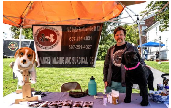
Elemental Pet Vets