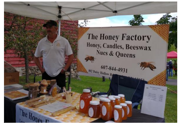
The Honey Factory