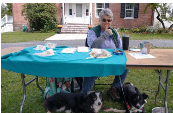
Snow Farm Creamery