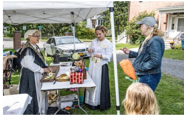
Old time crafts and games