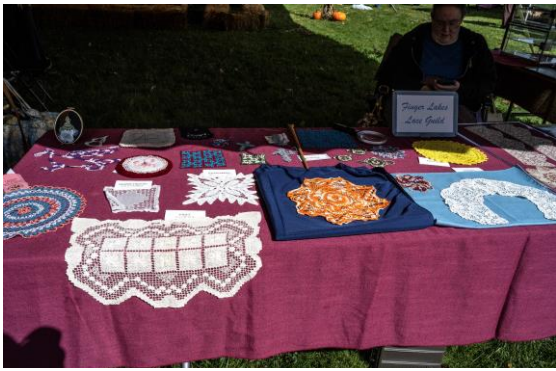
Finger Lakes Lace Guild