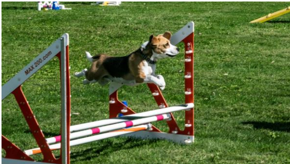
Ithaca Dog Training Club