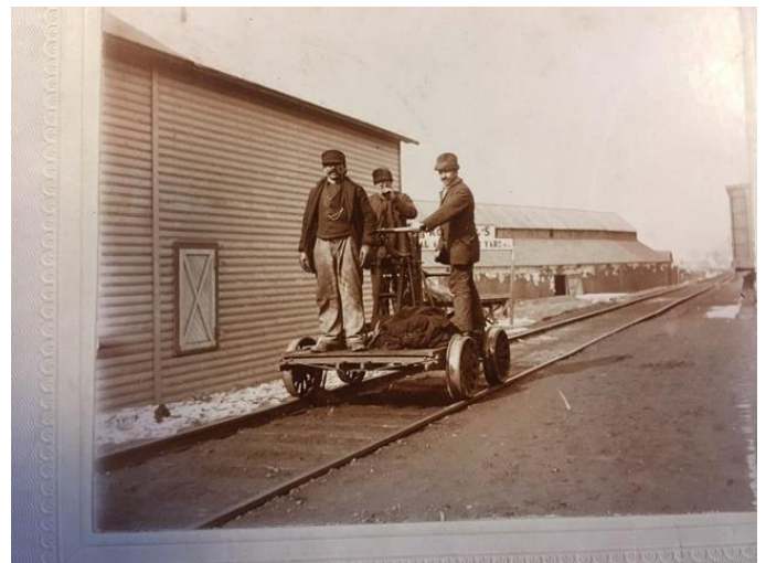
Rail crew at Borden’s milk plant

On April 26 th Fortnightly met at the Southworth Homestead for their annual guest night. Members and guests enjoyed a variety of appetizers while looking with interest at the new exhibits, or watching VHS tapes of old Footlighter productions.