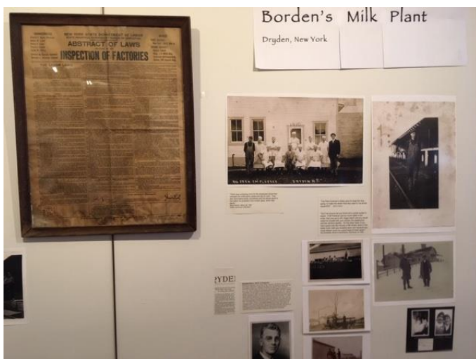
Borden Milk Plant display