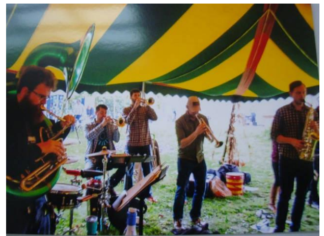
Fall Creek Brass Band