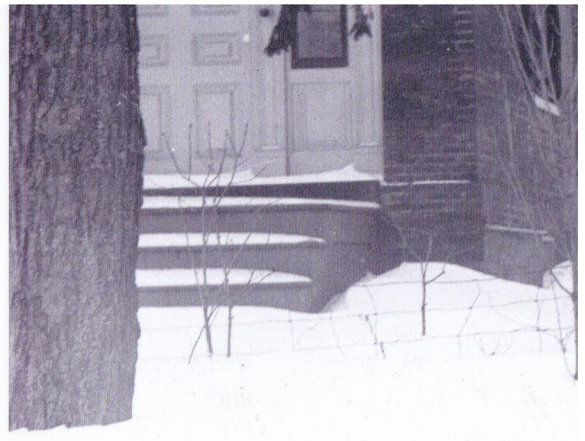
Close-up of wooden west stair.