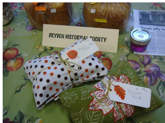
Violet jelly and wrapped dinner rolls make attractive offerings at DTHS Pie Sale