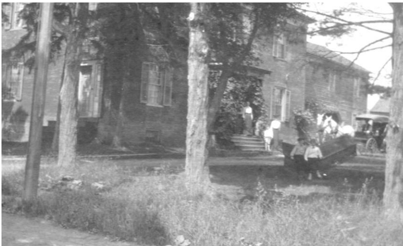
This ca. 1900 photo shows the west stair.